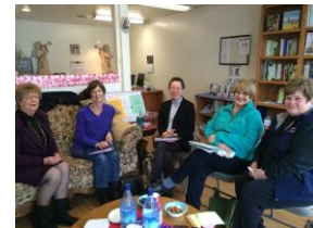
Some of the Eel River Valley Volunteers at a training.

Eel River Valley Outreach Center: This year a cadre of six volunteers staffed the small satellite site in Fortuna, the Eel River Valley Outreach Center. The site provides support 3-4 hours per week. It is located at the Fortuna office of Visiting Angels (also our support group location). McLean Foundation awarded grant funding to support the Center.